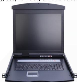
AL-DU932L FRONT VIEW

In addition, the AL-DU932L included an additional hot-pluggable USB port that supports other keyboard and mouse for back-up. With all of the technology involved, the AL-DU932L LCD KVM Switch has gone beyond the expectations and requirements for a modern Data Center use, which including : short space optimization, exceptional display quality, easy to install, extreme versatility.