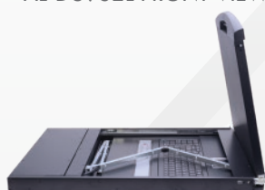
AL-DU932L SIDE VIEW