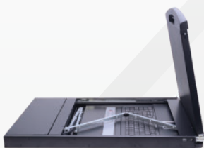
AL-DU932L SIDE VIEW