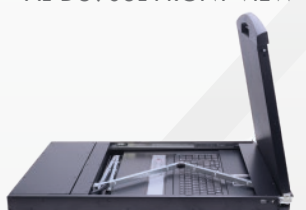
AL-DU908L SIDE VIEW