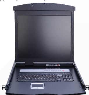
AL-DU1908L FRONT VIEW

In addition, the AL-DU1908L included an additional hot-pluggable USB port that supports other keyboard and mouse for back-up. With all of the technology involved, the AL-DU1908L LCD KVM Switch has gone beyond the expectations and requirements for a modern Data Center use, which including : short space optimization, exceptional display quality, easy to install, extreme versatility.